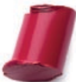
STRIKING SCARLET Revlon Super Lustrous Crème Lipstick in Cherries in the Snow, $8, drugstores