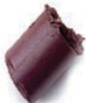
SHEER GRAPE Benefit Silky Finish Lipstick in Ms. Behavin, $16, benefitcosmetics.com