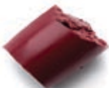
UNIVERSALLY FLATTERING WINE Laura Mercier Lip Colour Stickgloss in Cranberry, $20, lauramercier.com