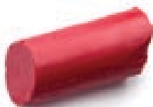
AUDREY HEPBURN MATTE RED M.A.C Mattene Lipstick in Seriously Rich, $14.50, maccosmetics.com