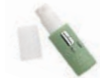
Clinique All About Lips, $20, clinique.com