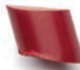
TRUE MAGENTA Maybelline Moisture Extreme Lipcolor in Crushed Cranberry, $7, drugstores