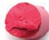
VIBRANT WATERMELON American Beauty Enduring Beauty Longwear Lipcolor in Ultimate Pink, $12.50, kohls.com