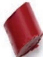
FIRE-ENGINE CRIMSON Estée Lauder Signature Lipstick in Rich Red, $20, estelauder.com