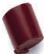
SOPHISTICATED STAIN Bobbi Brown Lip Color in Wine, $21, bobbibrown.com