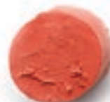
A FRESH TAKE ON CORAL Make Up For Ever Lipstick in #403, $18, sephora.com