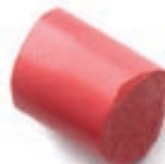
PRETTY, BALLET-SLIPPER PINK Giorgio Armani ArmaniSilk Lipstick in #26, $25, giorgioarmanibeauty.com