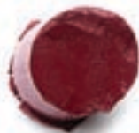
BIG BURGUNDY Lipstick Queen Lipstick in Wine Sinner, $18, lipstickqueen.com for stores