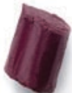
DEEP VIOLET Yves Saint Laurent Rouge Pure Shine Lipstick in #23, $28, nordstrom.com