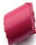
BRAZEN, DEEP PINK Christian Dior Rouge Dior Lipstick in Fuchsia Star, $26, dior.com for stores