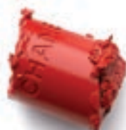
LUXE, WARM GARNET Chanel Rouge Allure Lipstick in Dazzling, $30, chanel.com