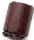
DEEP AND DRAMATIC MATTE Three Custom Color Lipstick in Cool Plum, $18.50, threecustom.com